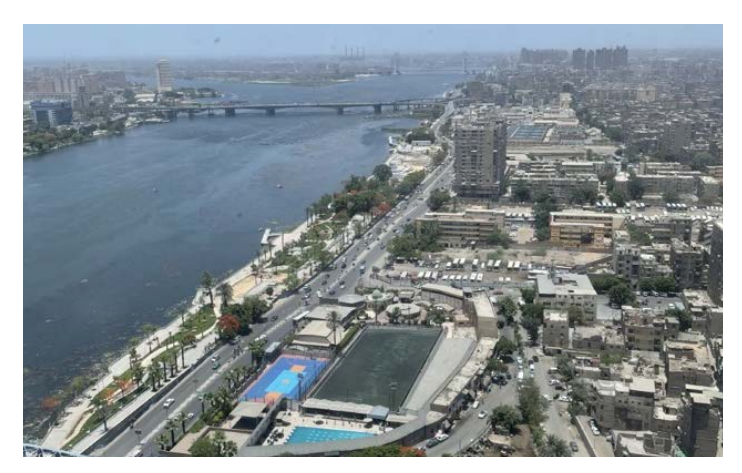
A birds eye view of Cairo City, Egypt.

Using OpenPaths, CitiME developed a proportionate and strategic transport model by incorporating and balancing a range of datasets, including data for mobility assessment and census data, as well as non-traditional data, such as road network vehicular traffic volume from GPS sources. The MTM includes a number of sub-models or applications with inputs, outputs, and loops. The flexibility and robust modeling capabilities of OpenPaths enabled CitiME to create traditional transportation models along with sophisticated and bespoke applications. The software used a macroscopic approach for strategic and multimodal modeling that accurately demonstrated in a visual platform the interaction between demand and offer to identify GCR mobility trends and principles to consider when making investments in transport initiatives.